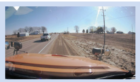
View from Minnesota DOT snow plow camera

The Maintenance TAG introduced a new innovation at the July STIC Business Meeting. The Snowplow Cameras and Automated Vehicle Locator (AVL) System will enhance the existing AVL system by integrating cameras on snowplows. This will make real-time road conditions available to the public through the <u>511PA system</u> and improve situational awareness for PennDOT, the Pennsylvania Emergency Management Agency, and other agencies.