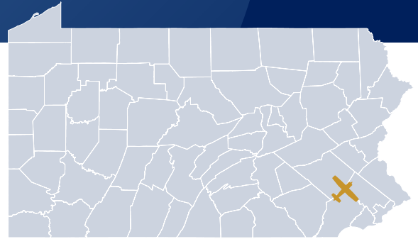
This airport is classified as a Limited Airport in Pennsylvania's State Aviation System Plan and is eligible to receive federal funding from the FAA.

Pottstown Municipal Airport (N47) is a general aviation airport, located in and owned by the Borough of Pottstown, about 20 miles outside of Philadelphia. Visitors to the airport are just minutes away from an area that is rich with attractions and things to do, such as golf, shopping, and a scenic railroad tour. Pottstown Municipal has 37 hangars and over 20 tie downs available for rental. The airport is operated by a fixed-base operator (FBO), which offers fueling, aerial sightseeing tours, aircraft rentals, and flight training. Pasquale Aviation is a maintenance facility offering routine aircraft maintenance, custom repairs, and rebuilding of vintage aircraft. The airport hosts an annual Airport Community Day and events for the Borough's Citizens Leadership Academy and special needs organizations. These events, along with the wide array of aviation activities seen at the airport, promote the facility as a vital part of the local community.