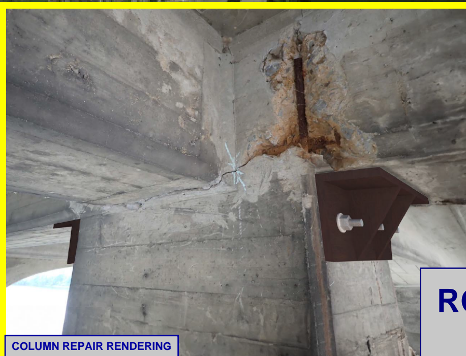
COLUMN REPAIR RENDERING