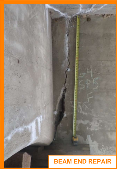
BEAM END REPAIR