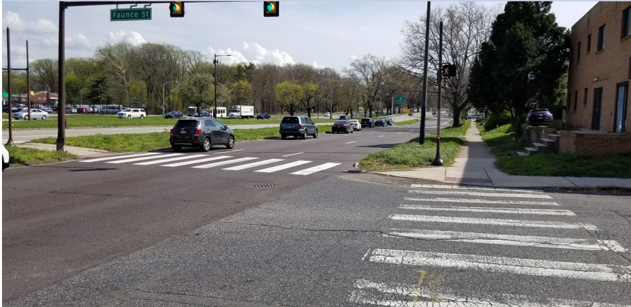
Photo 1: Southbound view of crossover congestion adjacent to U.S. 1 (Roosevelt Boulevard) and Faunce Street Intersection (Location #1)