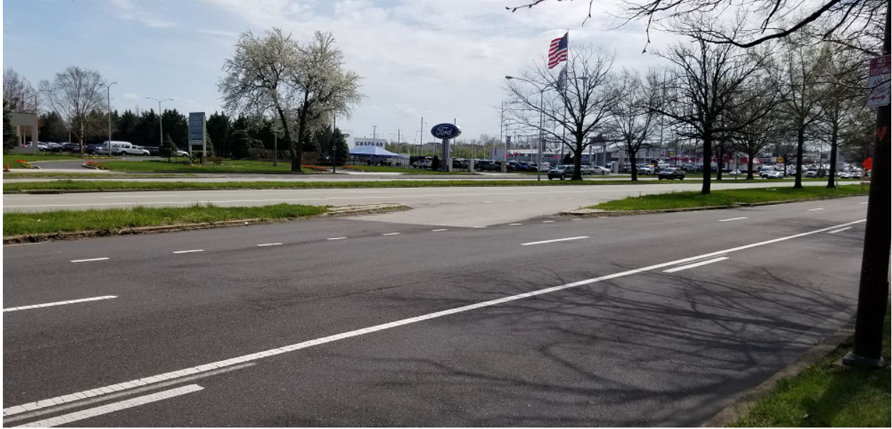
Photo 5: View of existing southbound crossover adjacent to the intersection of U.S. 1 (Roosevelt Boulevard) and Michener Street. (Location #4)