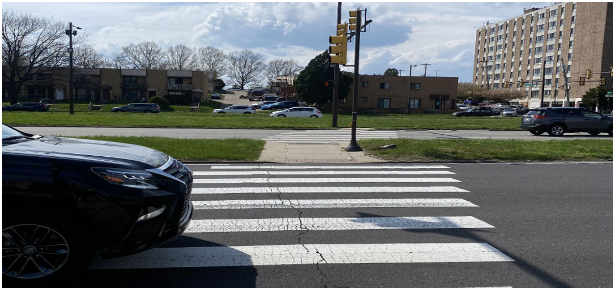
Photo 2: View of crosswalk alignment and pedestrian crossing refuge from East to West at the intersection of U.S. 1 (Roosevelt Boulevard) and Faunce Street (Location #1)