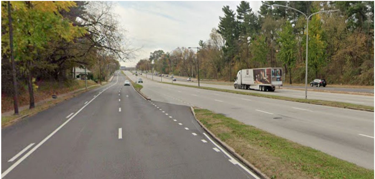
Photo 4: View of existing crossover at Winchester Avenue (Location #3)