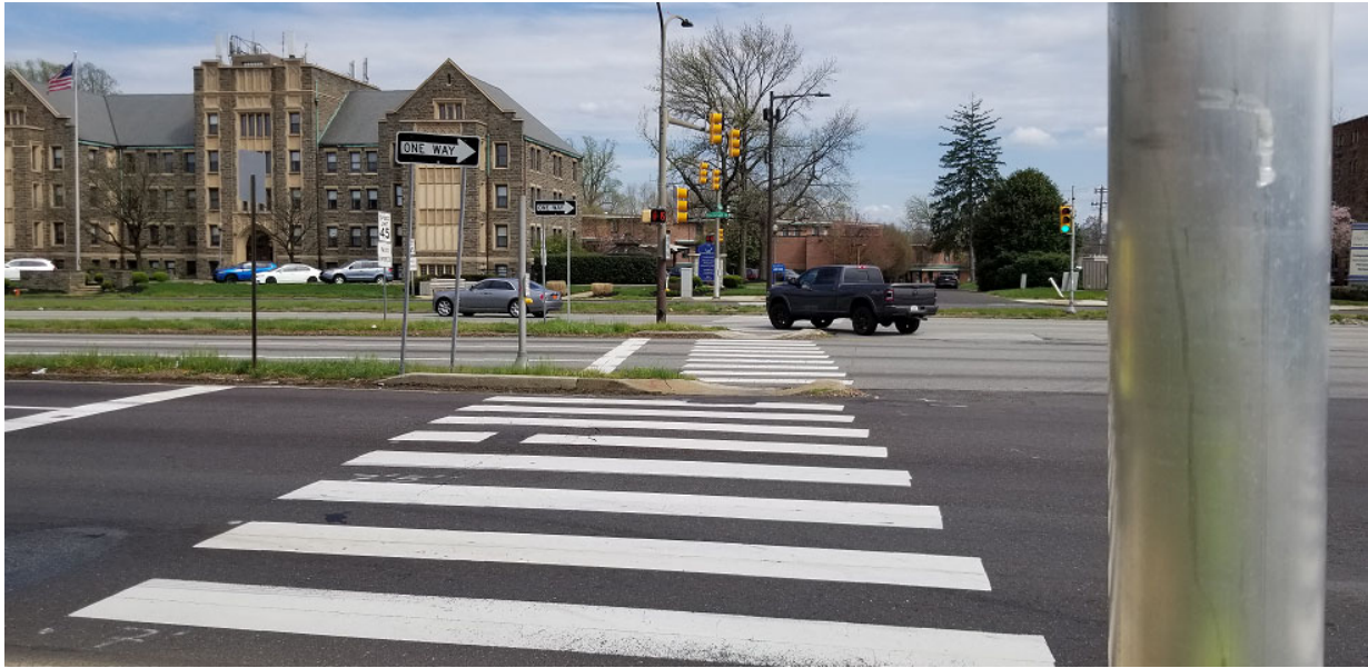
Photo 3: View of existing crosswalk alignment and pedestrian crossing refuge from West to East at the intersection of U.S. 1 (Roosevelt Boulevard) and Strahle Street (Location #2)