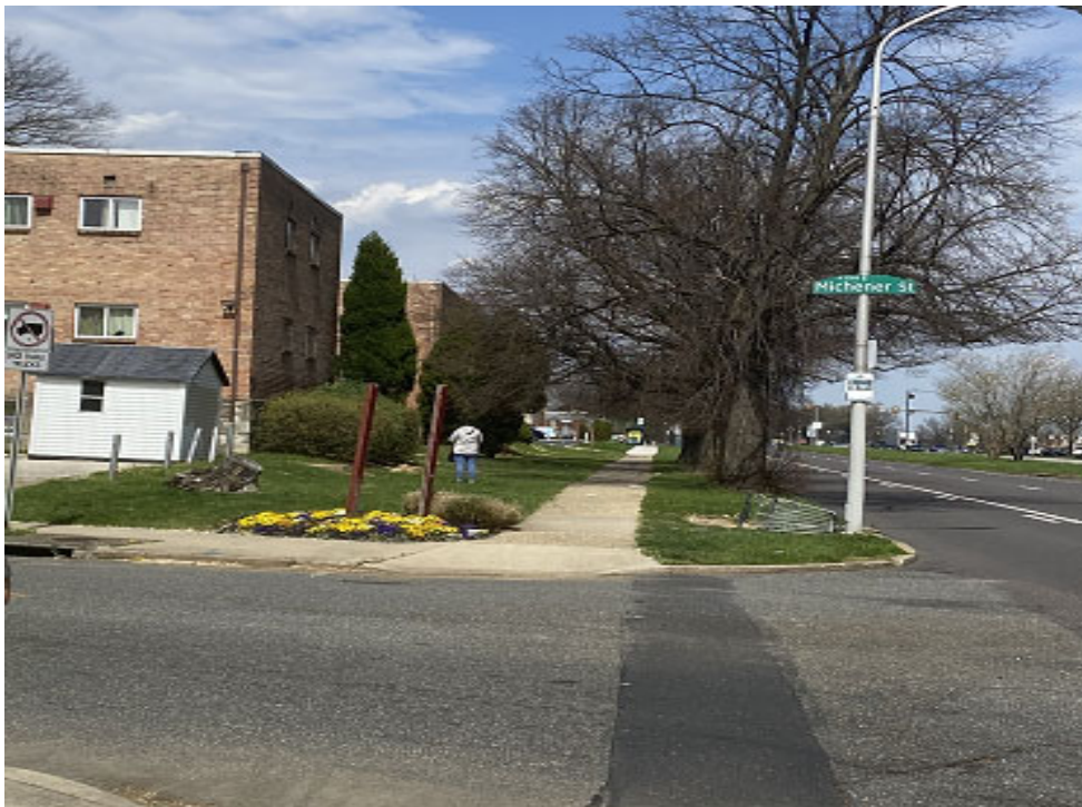
Photo 6: View of existing vegetation and possible sight obstruction for vehicles conducting a right turning movement from Michener Street onto U.S. 1 (Roosevelt Boulevard). (Location #4)