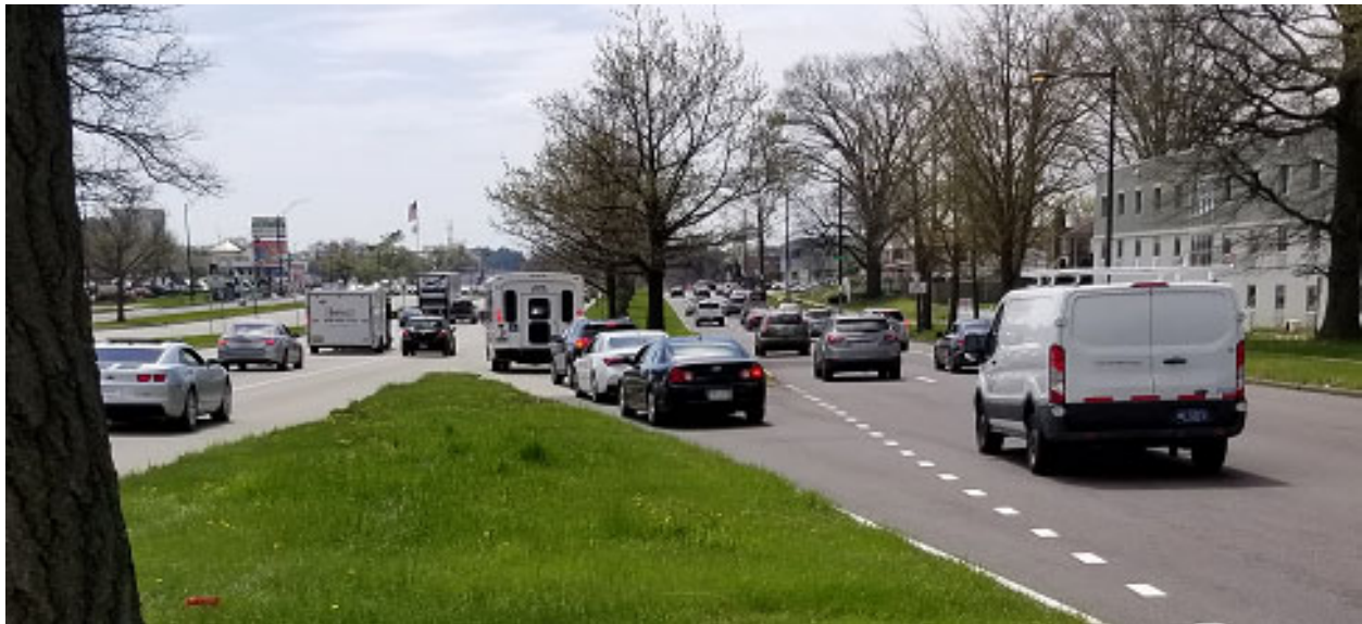
Photo 8: View of the southbound crossover adjacent to the intersection of U.S. 1 (Roosevelt Boulevard) and Fulmer Street (Location #5)