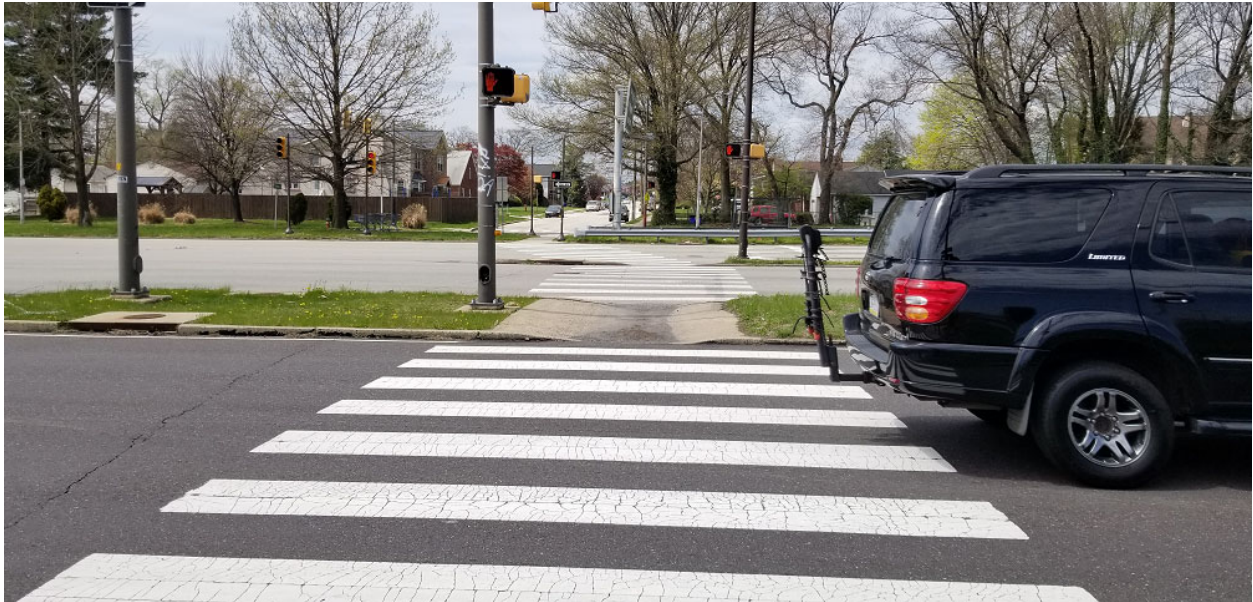
Photo 7: View of existing crosswalk alignment and pedestrian crossing refuge from East to West adjacent to the intersection of U.S. 1 (Roosevelt Boulevard) and Fulmer Street (Location #5)