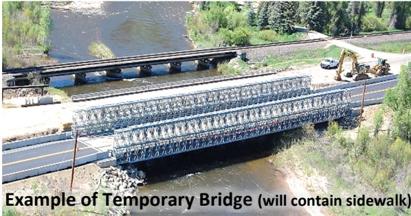
Example of Temporary Bridge (will contain sidewalk)

All questions or customer concerns pertaining to the project can be sent through the following - https://customercare.penndot.gov/