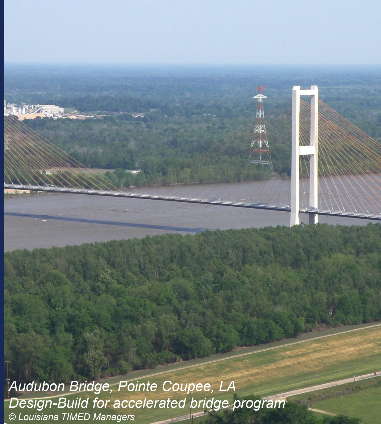
Audubon Bridge, Pointe Coupee, LA Design-Build for accelerated bridge program © Louisiana TIMED Managers