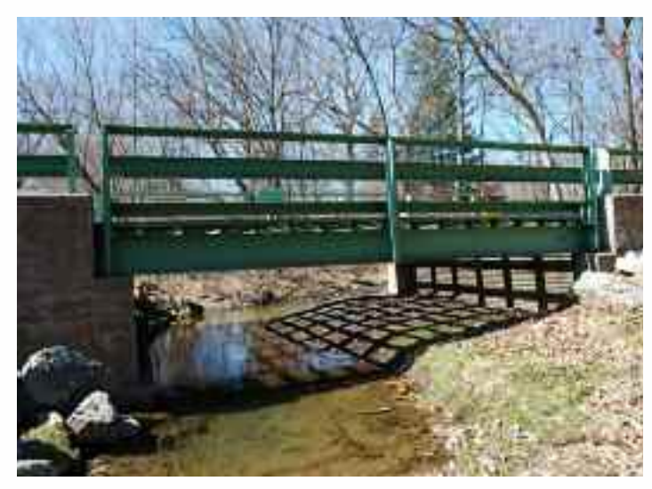
Northampton County will replace 28 bridges and rehabilitate five structures using P3 project delivery.

By using a P3 process to bundle the bridge replacements, the project is accelerating delivery and maximizing taxpayer investment. In fact, Northampton County estimates the program will reduce bridge repair costs by up to 30 percent and deliver the projects faster than through traditional procurement mechanisms.