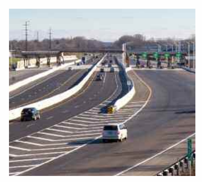
The selected private entity will install fiber optic cable and a wireless network throughout the PTC's 550-mile corridor.

In January 2017, the PTC hosted an industry forum to solicit feedback from the broadband industry prior to the PTC's development of a Request for Qualifications (RFQ), which is expected to be issued in July 2017. Through this partnership, the private development entity would design, build, finance, operate, maintain and market the fiber optic cable network for the PTC's use under a long-term agreement. Wireless infrastructure would also be built as part of the project, but would be maintained by the private sector for a short term of about five years before being turned over to the PTC.