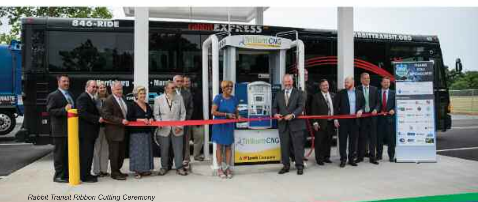
on June 15, 2017.