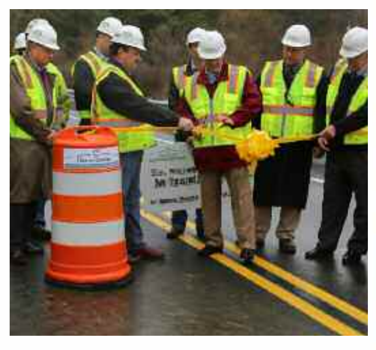
The project helps PennDOT replace structurally deficient bridges and bring lasting value to Pennsylvania residents.

The RBR project is making a lasting impact in communities across the state by enhancing infrastructure and generating jobs. Through this project alone, PWKP has engaged 45 Pennsylvania-based subcontractors to assist with the bridge design and construction. Additionally, the RBR project allows PennDOT to leverage private investment in a way that simply would not be possible without enabling P3 legislation. Without P3 project delivery, it may have taken years to address these bridges, which would have resulted in travel delays to the public and higher future costs.