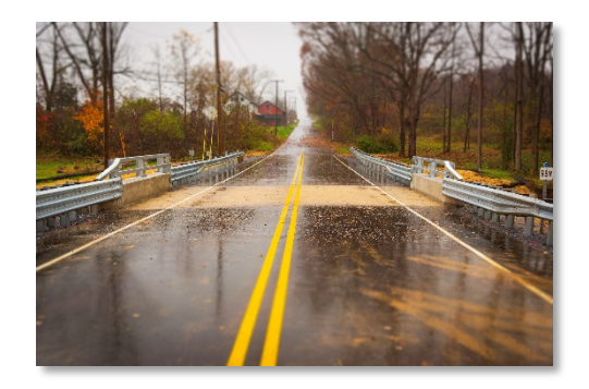
Bridge JV-577, Jonestown Road (RT 4013) Tributary to Raccoon Creek, Lebanon County