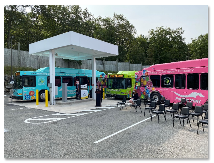
Swiftwater Station Ribbon Cutting Ceremony, September 2020

PennDOT selected Trillium CNG as the development entity and partner to supply CNG fueling equipment to 24 transit facilities which will fuel up to 750 buses throughout the Commonwealth. Trillium will make CNG-related safety upgrades to existing transit maintenance facilities and will design, build, finance, operate and maintain the CNG fueling stations. Trillium will be responsible for maintaining the stations until 2037. The Department also entered into agreements with transit agencies, establishing commitments to CNG fuel purchases and operational requirements. The project will provide access to commercial CNG fueling stations for owners of private vehicles and business fleets in areas with sufficient market demand. The