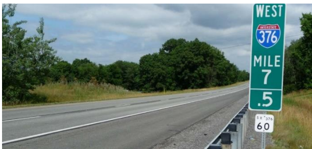
General view of the S.R. 0376 Project Area

During the 2 nd year evaluation, the inspector observed expansion of various longitudinal joints, some spalling, and shoulder edge deterioration in the control section only. With the exception of these failures, the overall condition of the project appeared to perform better than expected.