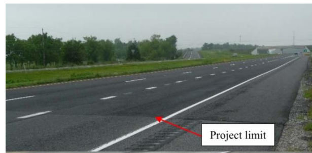
View of the S.R. 0015 Project from the project limits

Formal evaluations of the project are being conducted for a period of 10 years from the placement of the asphalt mix. To date, these projects have performed well. In 2018, three years after the completion of these projects, PennDOT formally approved the use of AR-GG and included the technology in Publication 408 – Construction Specification. These projects will continue to be monitored on an annual basis.