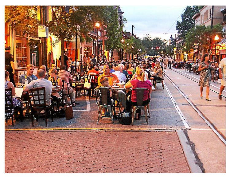
A downtown street in Media, Pa., provides a sense of place and attracts pedestrians.

Are your downtown streets public destinations, or are they simply throughways to and from the workplace? Is the transportation element of your comprehensive plan nothing more than a discussion of the network of arterial, collector, and local roads? Do your streets and parking facilities help make or break your community's character, sense of place, and identity?