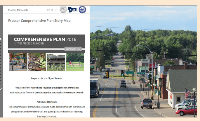
Story Map: Sharing Your Comprehensive Plan

The City of Proctor, a small town in Minnesota, highlights key sections of its latest comprehensive plan using a story map. The plan's transportation vision shares the residents' desire for improved sidewalk conditions and better connectivity.