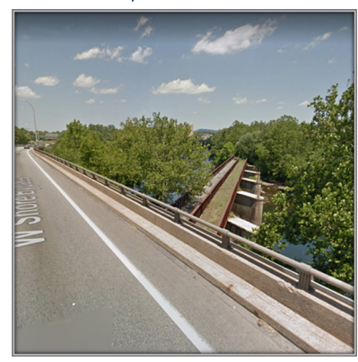
Existing pedestrian bridge (former RR bridge) beneath West Shore Bypass.

US 422 (WEST SHORE BYPASS) FROM ROUTE 12 TO US 422 BUSINESS IN CUMRU AND EXETER TOWNSHIPS, WEST READING AND WYOMISSING BOROUGHS, AND THE CITY OF READING, BERKS COUNTY