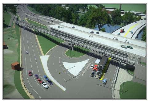
Conceptual design of West Shore Bypass with new pedestrian bridge provides connectivity for businesses and community, access to the Thun Trail, and safety for pedestrians and bicyclists.