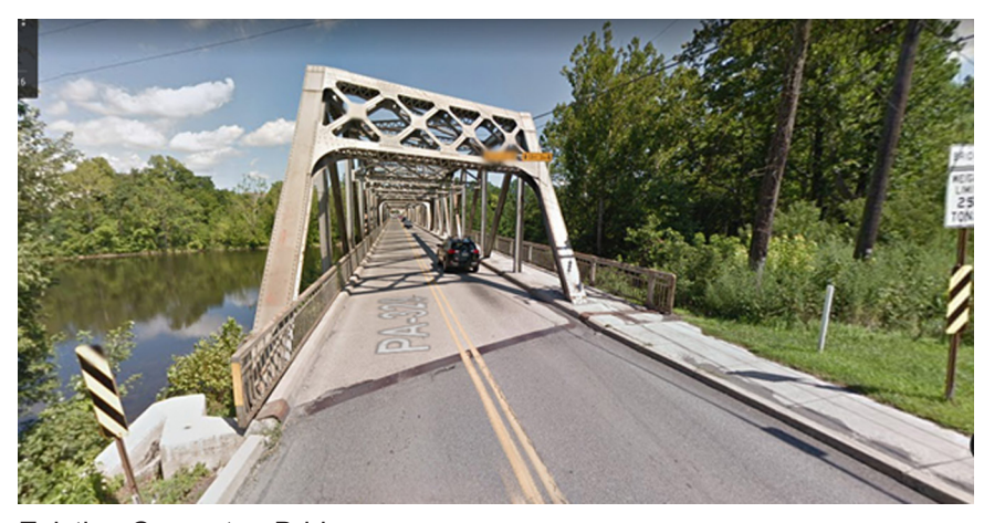
Existing Cementon Bridge