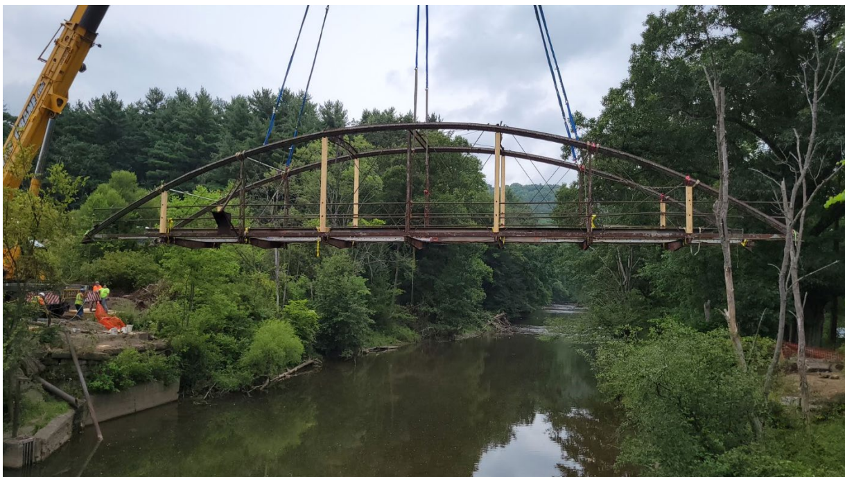
Messerall Bridge being lift from its original foundations.