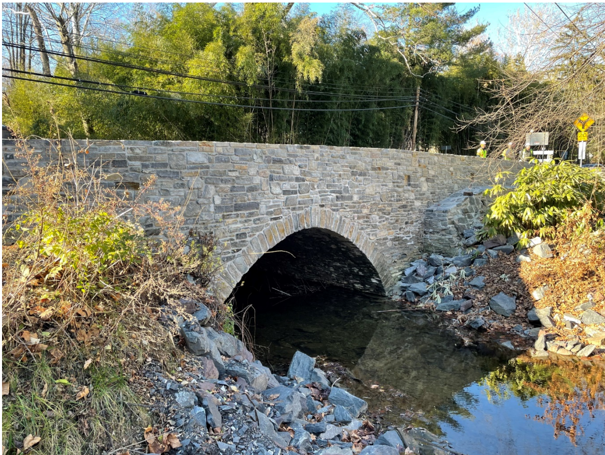
Trinity Lane Bridge after rehabilitation.

5,000 vehicles per day. This historically significant bridge is the fifth oldest highway bridge in the United States and third oldest bridge in Pennsylvania. The rehabilitation program scope of work included removal of the bituminous pavement, earth fill, and stone parapets. Deteriorated portions of the arch barrel, spandrel walls, and wingwalls were dismantled and rebuilt. The concrete portion of the arch barrel and ringstones on the upstream side was replaced with stone. A lightweight concrete fill was placed between the spandrel walls, and a full width concrete slab with integral concrete barriers was constructed and faced with stone salvaged from the bridge parapets and new supplemental stone. A bituminous wearing surface was placed on the concrete moment slab. The masonry spandrel walls and wingwalls were repointed. The bridge plaques were salvaged, cleaned, and reset in the rehabilitated bridge parapet. Brown painted guiderail was installed at two corners.