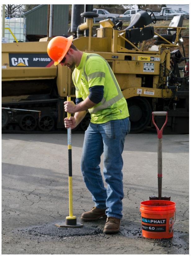
Pour Water Tamp