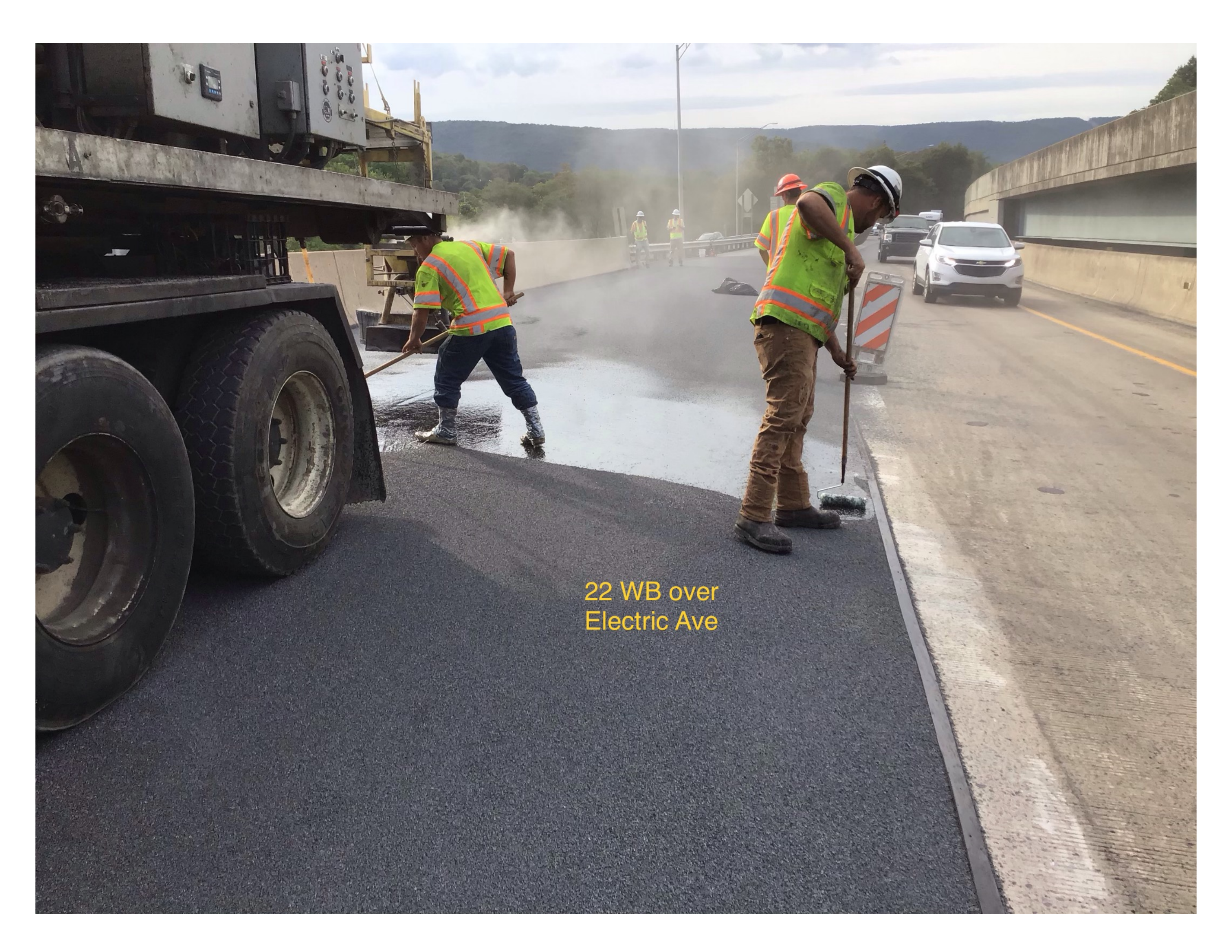
Applying Epoxy Surface Treatment