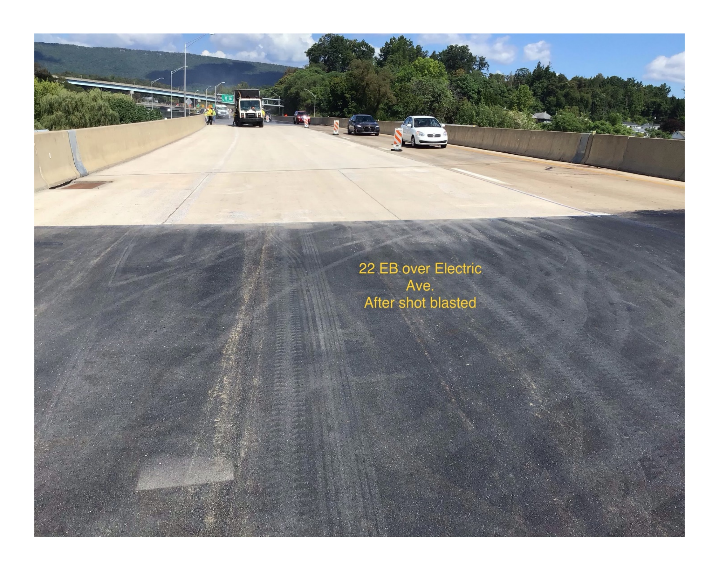
Surface is prepared by shot blast to ensure adhesion to the deck