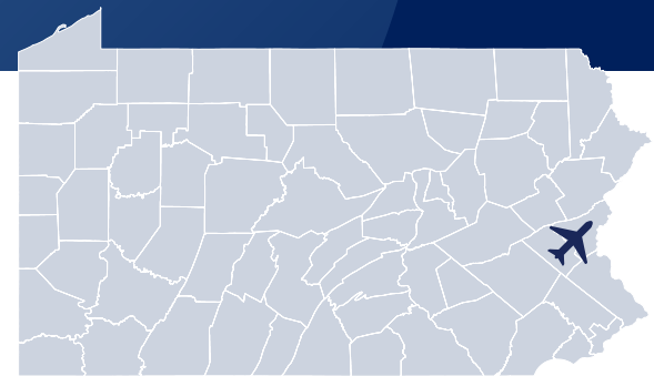
This airport is classified as a Commercial Service Airport in Pennsylvania's State Aviation System Plan and is eligible to receive federal funding from the FAA.

Lehigh Valley International (ABE) is the fourth largest commercial service airport in Pennsylvania (by passenger activity) and the second largest by air cargo volume located near Allentown, Bethlehem, and Easton. The airport is served by four passenger airlines (Allegiant, American, Delta, United) and air cargo operators Amazon Air and FedEx Express. Lehigh Valley International Airport offers 15 nonstop flights to both leisure destinations and airline hubs, some of which include: Atlanta, Charlotte, Chicago, Detroit, Myrtle Beach, Nashville, Orlando/Sanford, and Sarasota. While it serves as a small hub airport for the eastern Pennsylvania region, ABE spans over 2,200 acres and is home to 130 corporate and general aviation aircraft. The airport has a significant economic impact on the regional economy for tourism and the logistics industry. The airport also provides a variety of general aviation services, including aircraft rentals, charters, maintenance/avionics, and flight training.