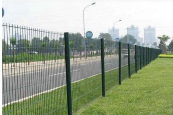
OPTIONS FOR PROPOSED FENCE BETWEEN WESTBOUND S.R. 0290 AND RAILROAD