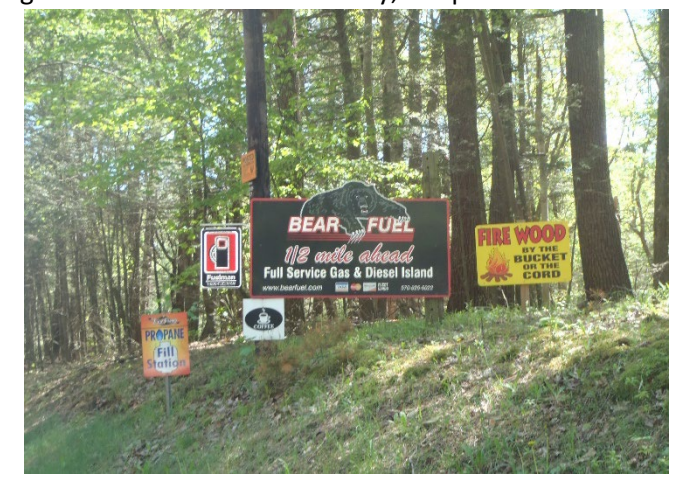
These signs are along Route 118 in Columbia County.

municipality's ordinance prohibits that sign.