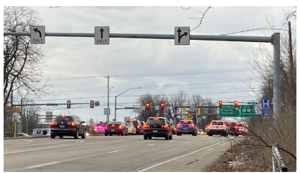
The effects of the development for all road users will be considered in the TIS.

improvements or capital expenditures of any nature whatsoever or impose any contribution in lieu thereof, exaction fee, or any connection, tapping or similar fee except as may be specifically authorized under this act."