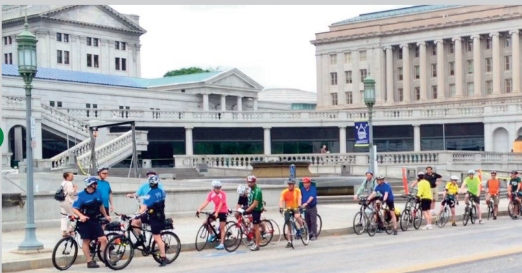
Cyclists line-up in preparation of an "Executive Ride" around the Capitol City in celebration of Bike to Work Week May 11-15, 2015.

Governor Tom Wolf issued a proclamation commemorating May 11 to 15 as Bike to Work Week as representatives from five state agencies joined other state and local officials on May 11 to kick off the week with an executive ride around Harrisburg.