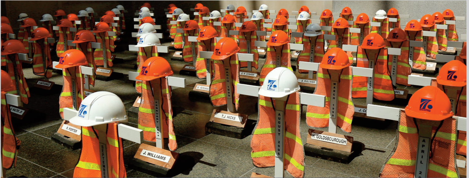
PennDOT's traveling Work Zone Safety memorial honors the 85 PennDOT employees who lost their lives in the line of duty since 1970.

PennDOT and the Pennsylvania Turnpike joined the American Traffic Safety Services Association (ATSSA), the Associated Pennsylvania Constructors (APC), and Flagger Force to honor lives lost in work zones across the country as the National Work Zone Memorial came to Pennsylvania.