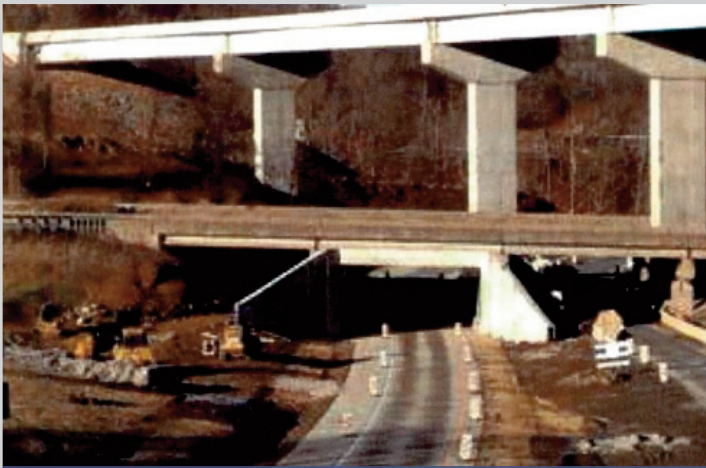
Flyover Bridge and Tunnel