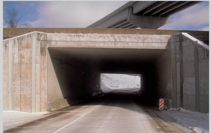
Tunnel from Route 70

District 12 undertook the redesign of the I-70/79 South Junction Project in Washington County to improve the safety of an older junction of I-79 North and I-70 West. The result? Innovative design and construction techniques involving two main components: a flyover bridge design and the replacement of two, four-span bridges with a tunnel structure.