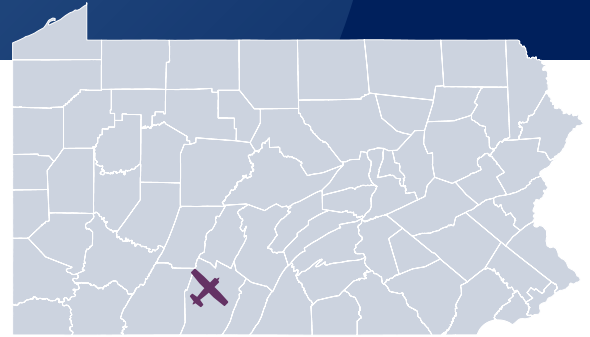
This airport is classified as a Advanced Airport in Pennsylvania's State Aviation System Plan and is eligible to receive federal funding from the FAA.

Bedford County Airport (HMZ) is a general aviation airport located roughly four miles north of Bedford's historic downtown district. The airport serves as the gateway to the world-famous Omni Bedford Springs Resort, located one mile south of Bedford. The airport's single 5,500-foot runway is capable of supporting most corporate aircraft and the airport prides itself on welcoming a substantial amount of business and corporate travel. This type of activity is particularly prominent as the airport is situated adjacent to the Bedford Commerce Park and a Walmart distribution center. Bun Air Corporation serves as the fixed-base operator (FBO) for the airport and provides a variety of services including aircraft maintenance, avionics repair, charter flights, aircraft fueling and flight instructions. Additionally, the airport provides easy access to I-99 and the Penna Turnpike, allowing visitors to quickly travel to local outdoor destinations such as Blue Knob State Park and Shawnee State Park.