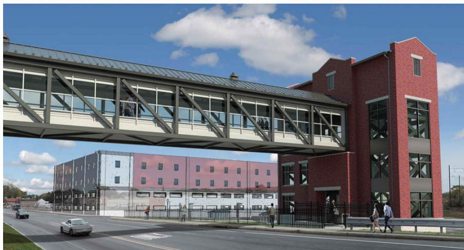
Rendering of Pedestrian Bridge and Potential Commercial Development