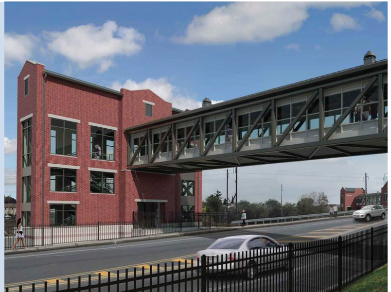
Rendering of New Middletown Station Pedestrian Bridge