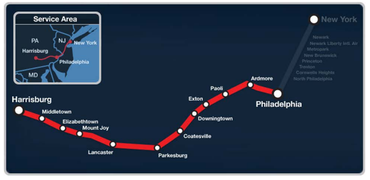
Exhibit 1. Location of Middletown Station on the Keystone Corridor

PennDOT plans to fund such a project at the Middletown Station, the first station east of Harrisburg on the Keystone Corridor. See Exhibit 1 for the location of Middletown Station.