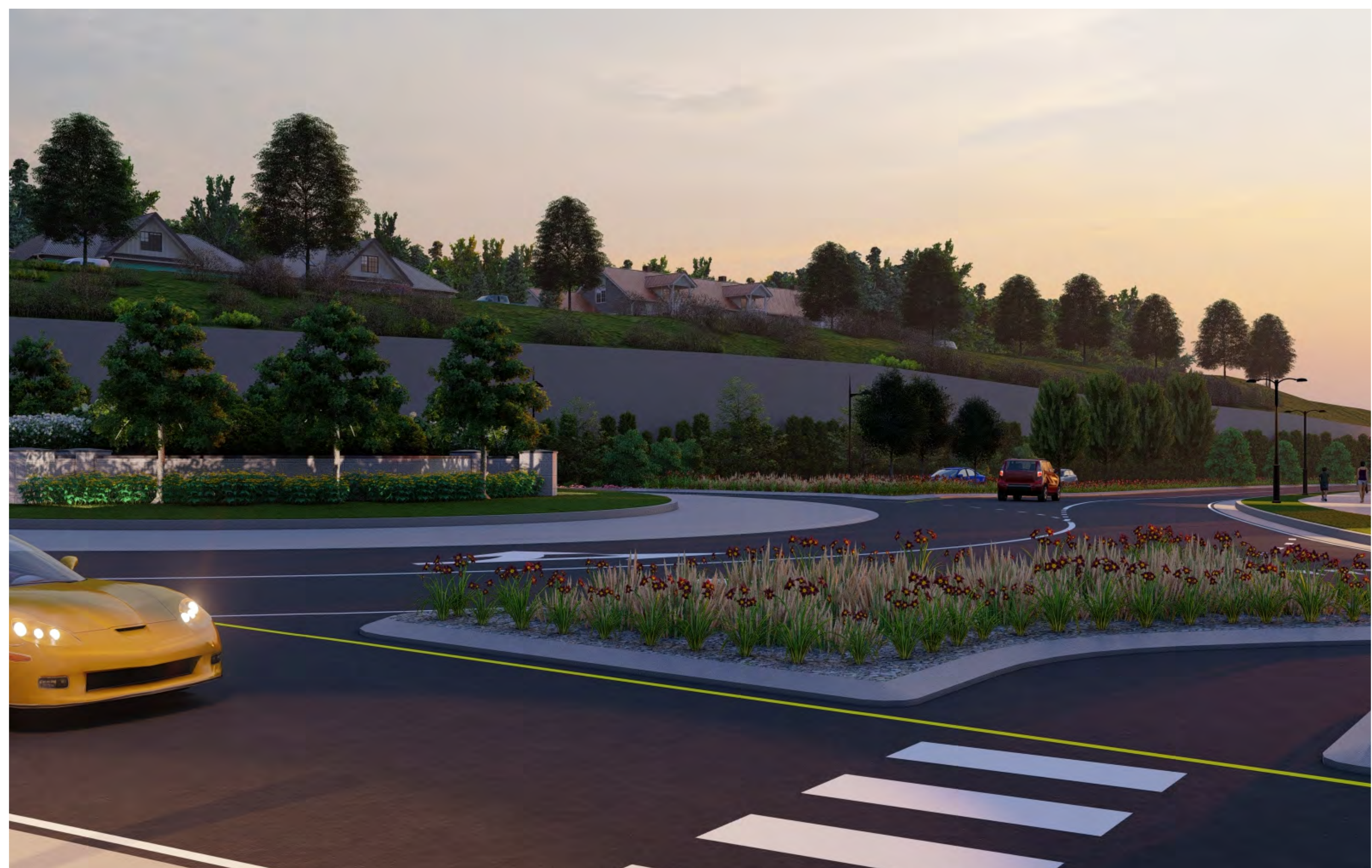
LOOKING SOUTH TOWARDS RESIDENTIAL BLUFF