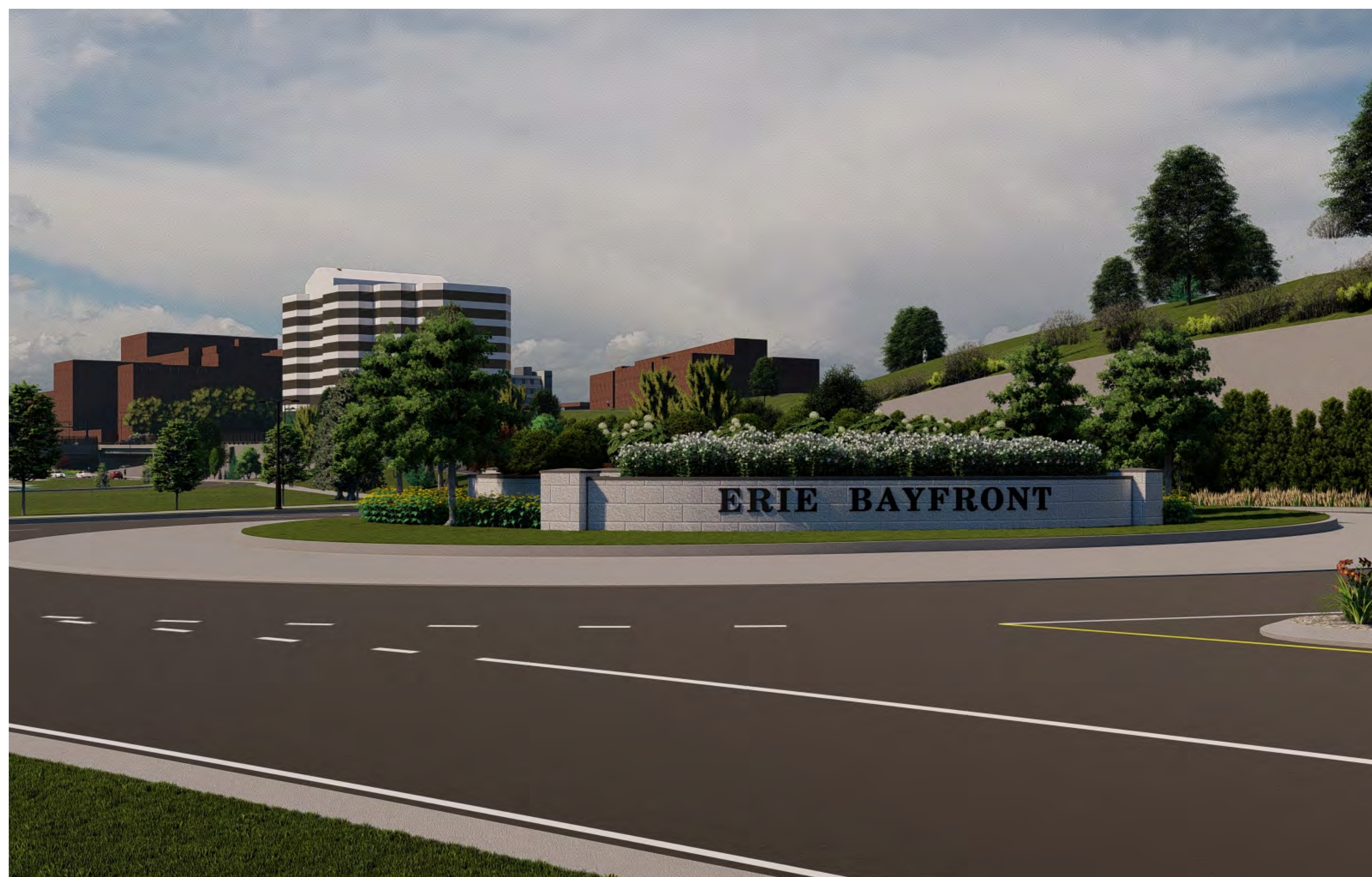
LOOKING EAST TOWARDS STATE STREET