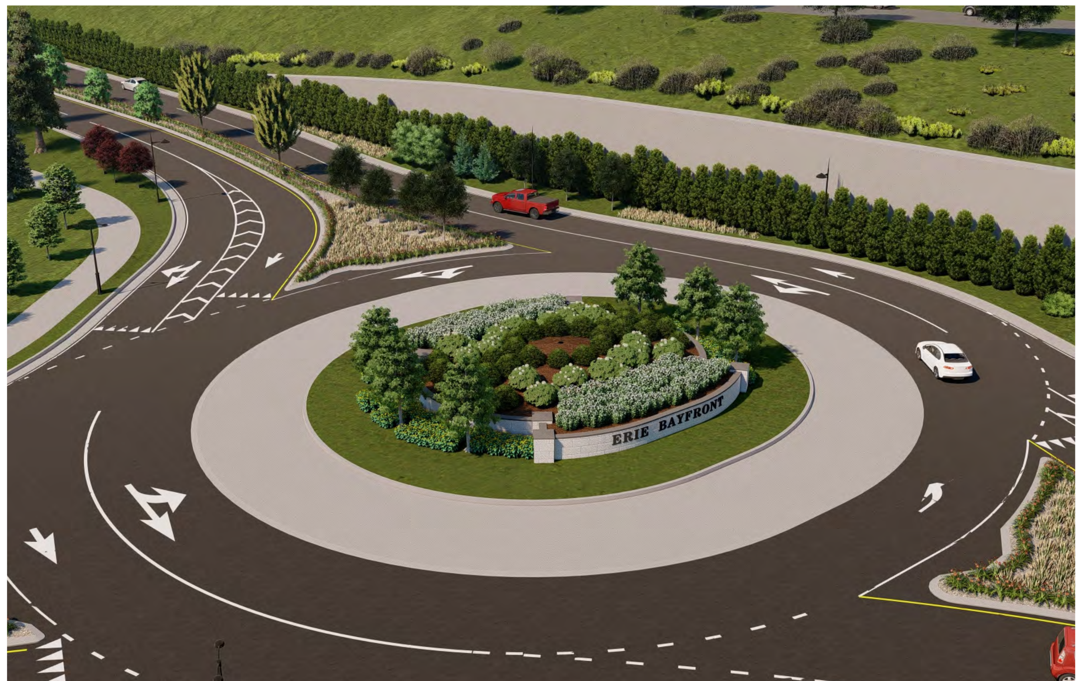
LOOKING SOUTHEAST TOWARDS STATE STREET