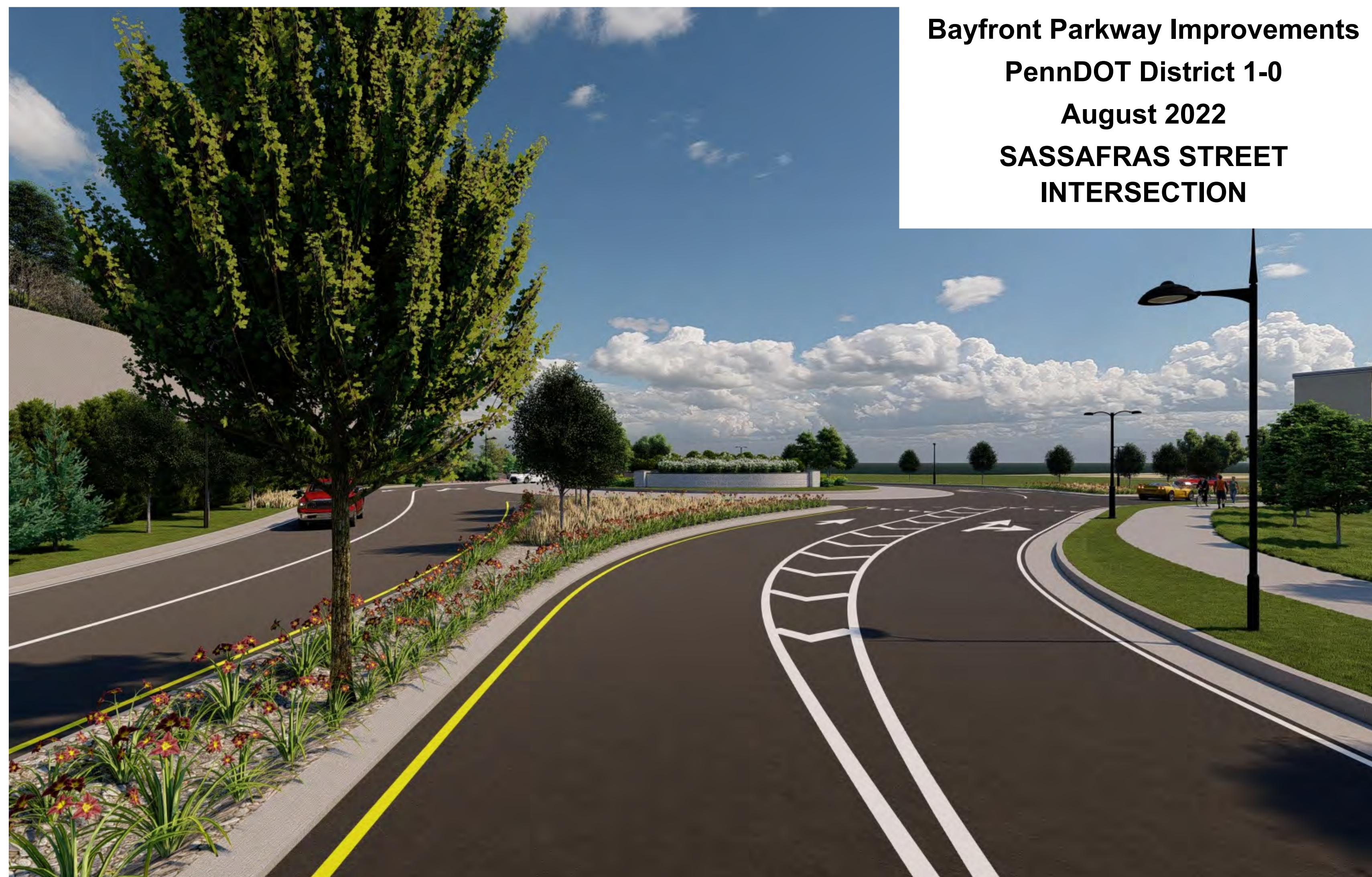
LOOKING WEST TOWARDS ERIE WATER WORKS